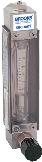
Sho-Rate™ Model 1358