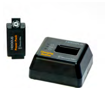
Battery and charging station