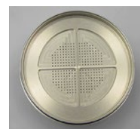
Figure 2. Nozzle pattern for Stage 3