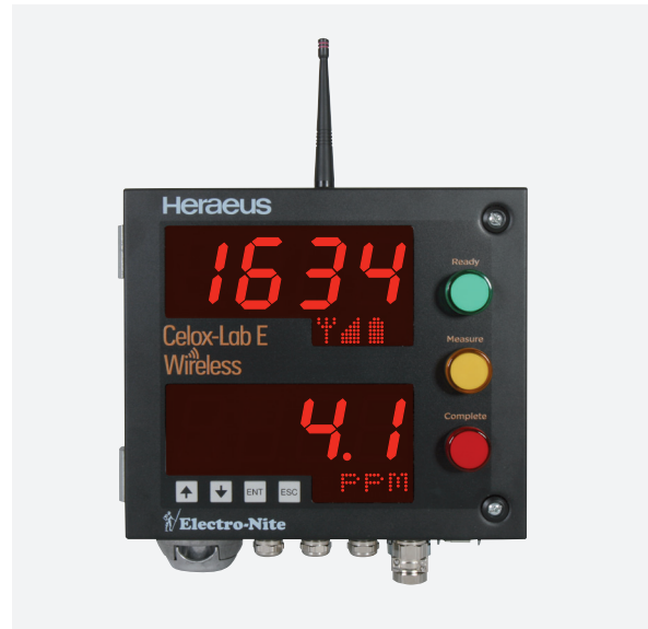
Celox-Lab E Wireless